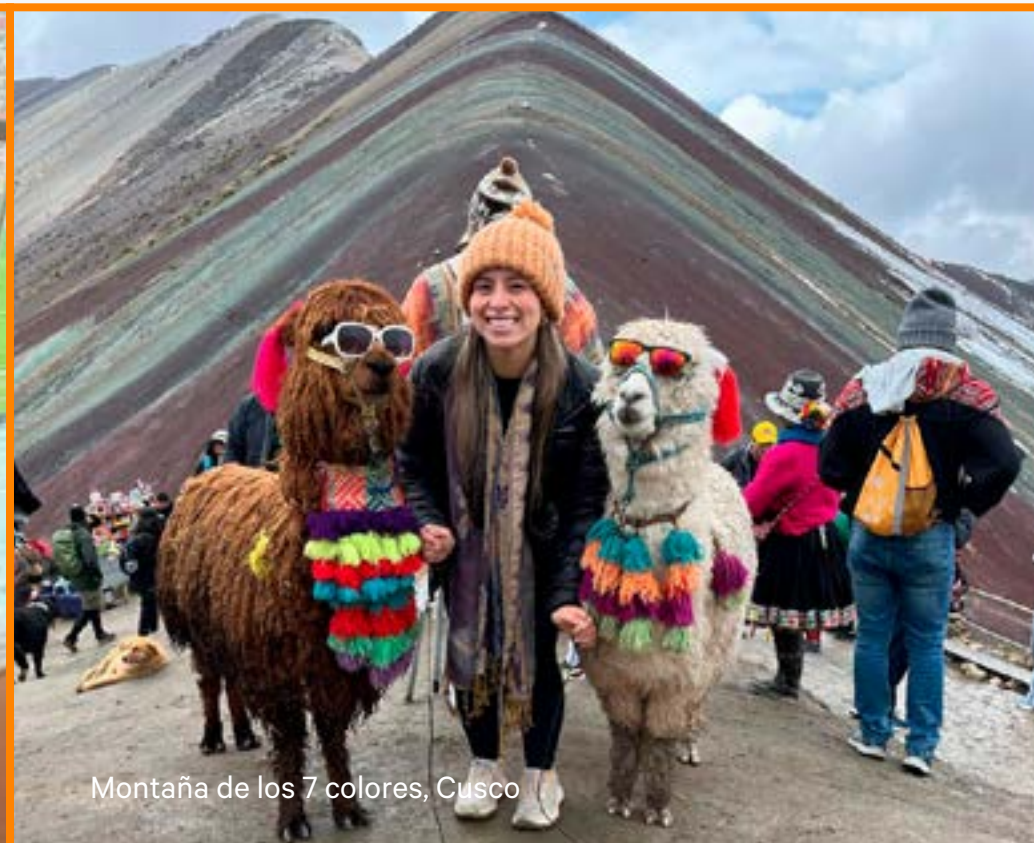
Montaña de los 7 colores, Cusco