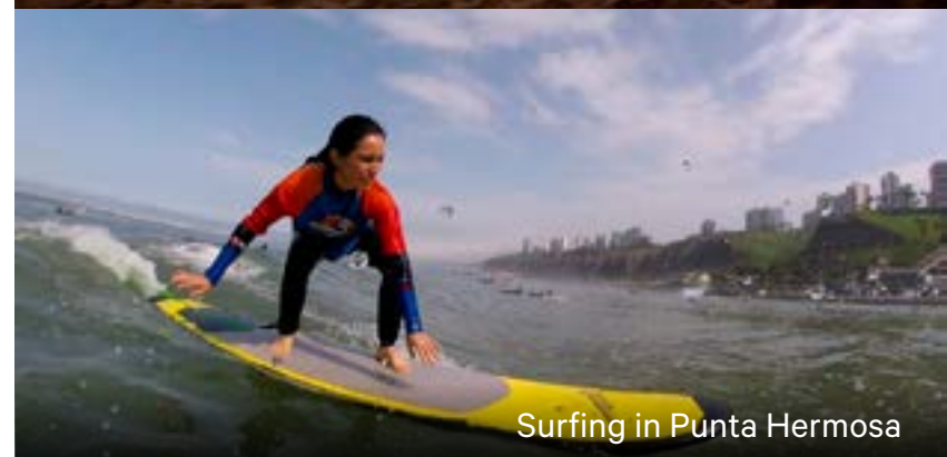
Surfing in Punta Hermosa