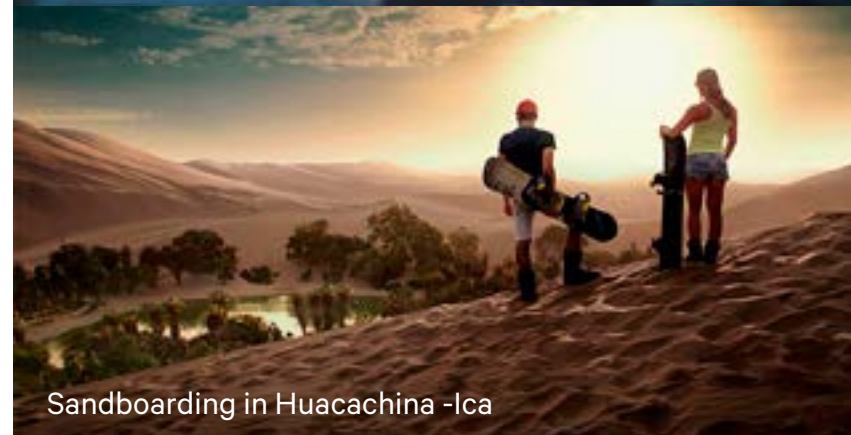
Sandboarding in Huacachina - Ica