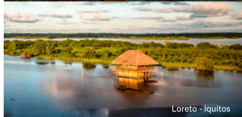
Loreto - Iquitos