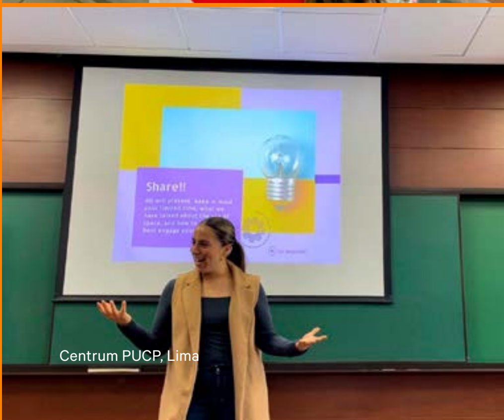
Centrum PUCP, Lima