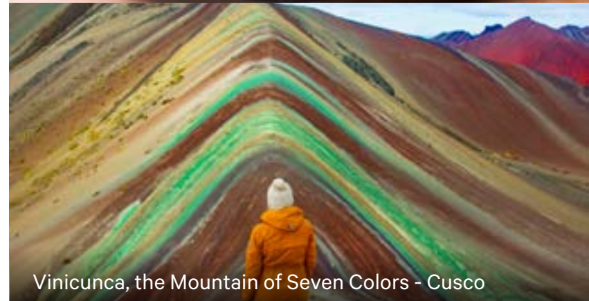
Vinicunca, the Mountain of Seven Colors - Cusco